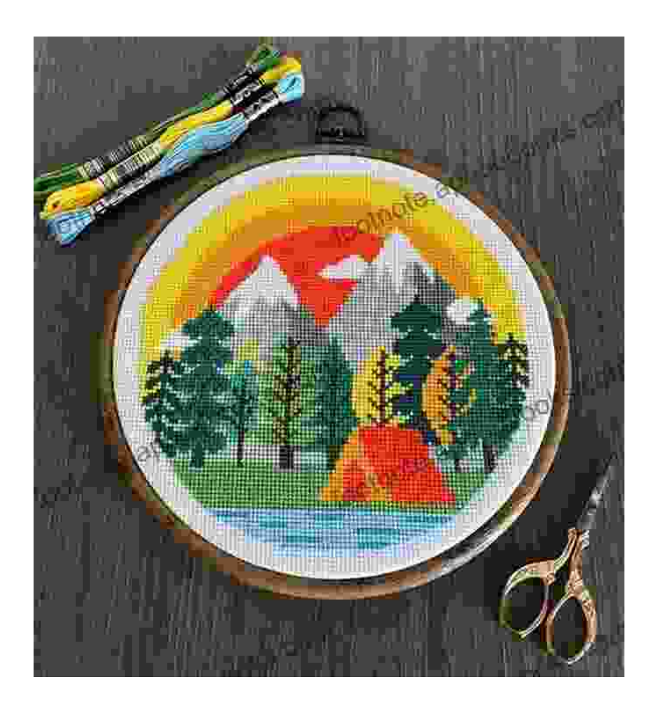
Escape into the Serene Embrace of Nature