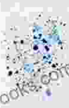
Blue and Orange Paper