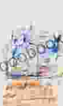
Blue and Orange Paper