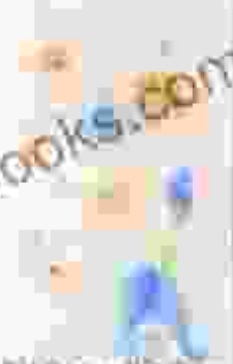
Blue and Orange Paper