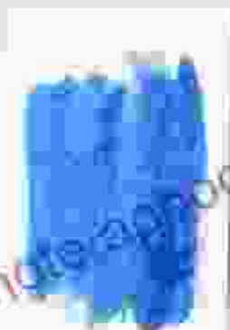
Blue and Orange Paper