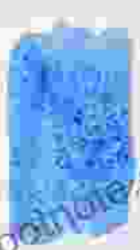
Blue and Orange Paper