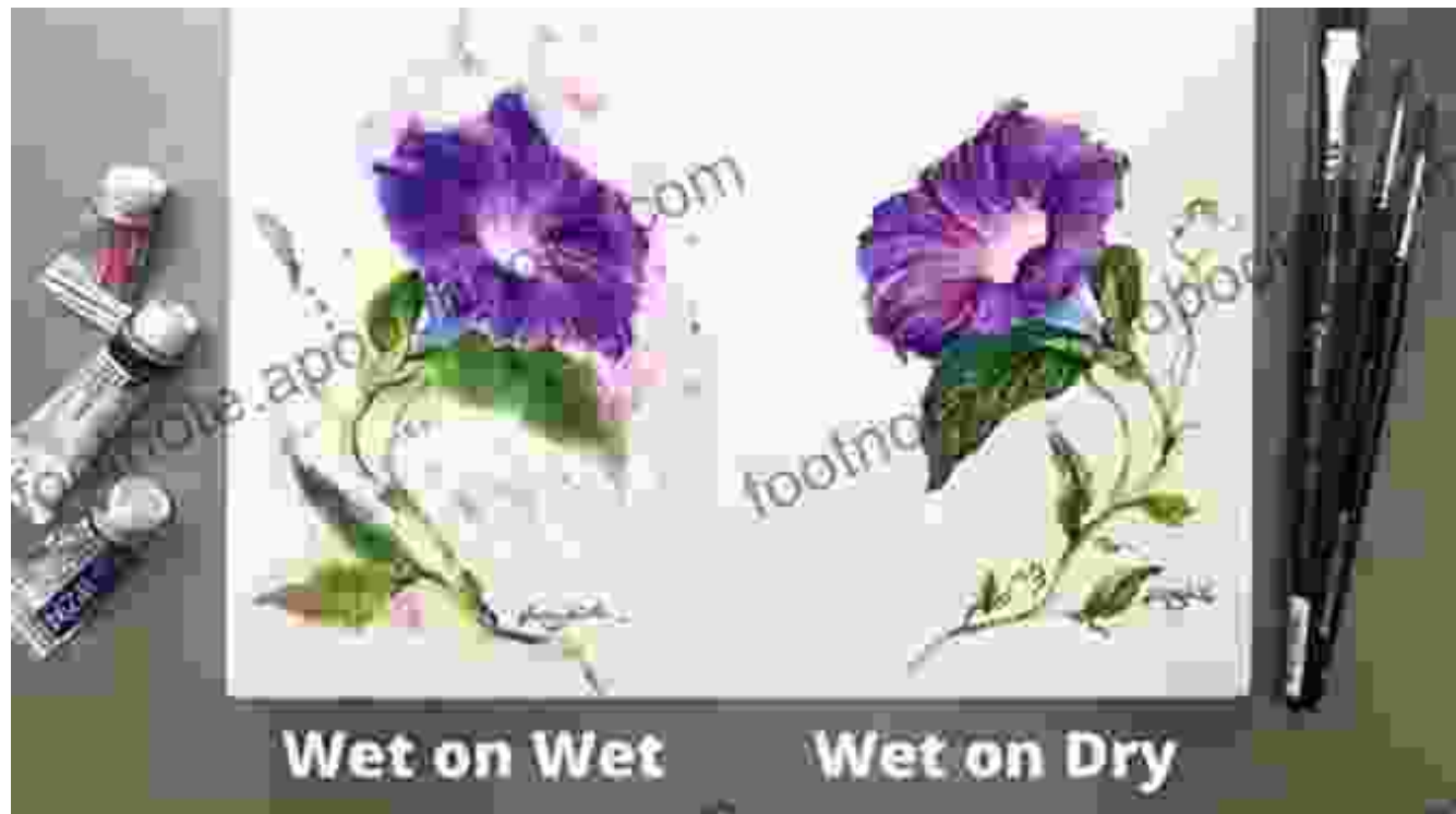
Wet on Wet