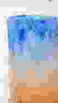
Blue and Orange Paper