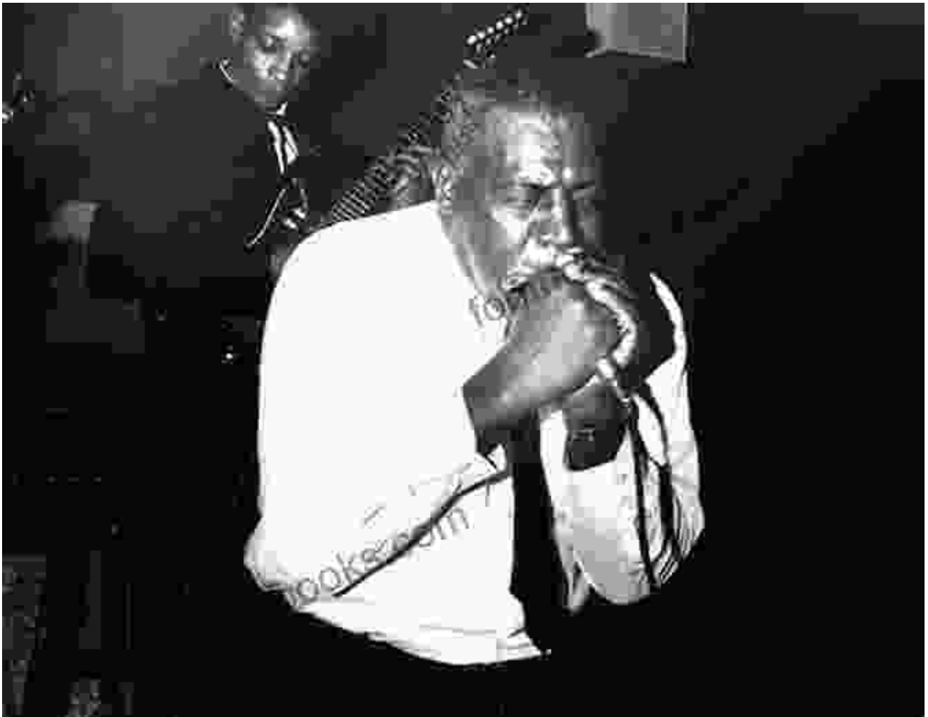
Howlin' Wolf in action

slide guitar created a distinctive sound that captivated audiences. Wolf's hit songs, including "Killing Floor" and "Spoonful," became blues classics.