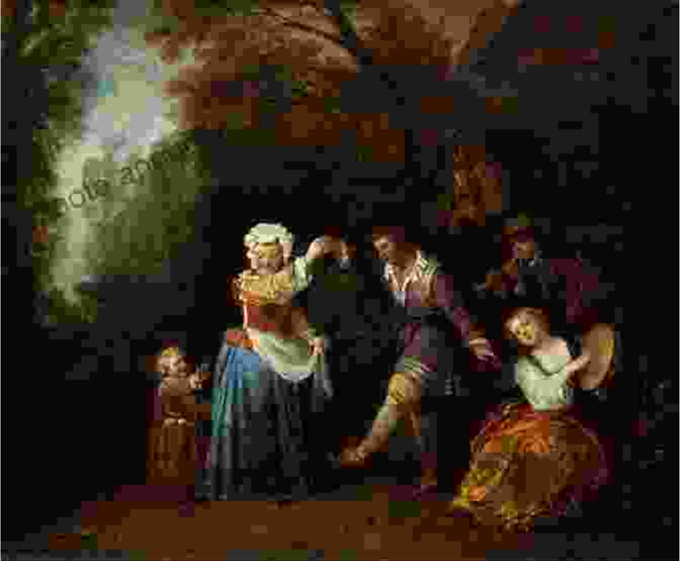
The Dance by Jean-Antoine Watteau

The exhibition also features several paintings depicting courtly dances. Jean-Antoine Watteau's The Dance is a prime example. This enchanting painting captures the grace and elegance of a masked ball, where couples whirl and twirl in a harmonious symphony of movement. The soft colors and ethereal atmosphere create a sense of romance and enchantment, inviting viewers to revel in the beauty and exuberance of the Baroque dance.