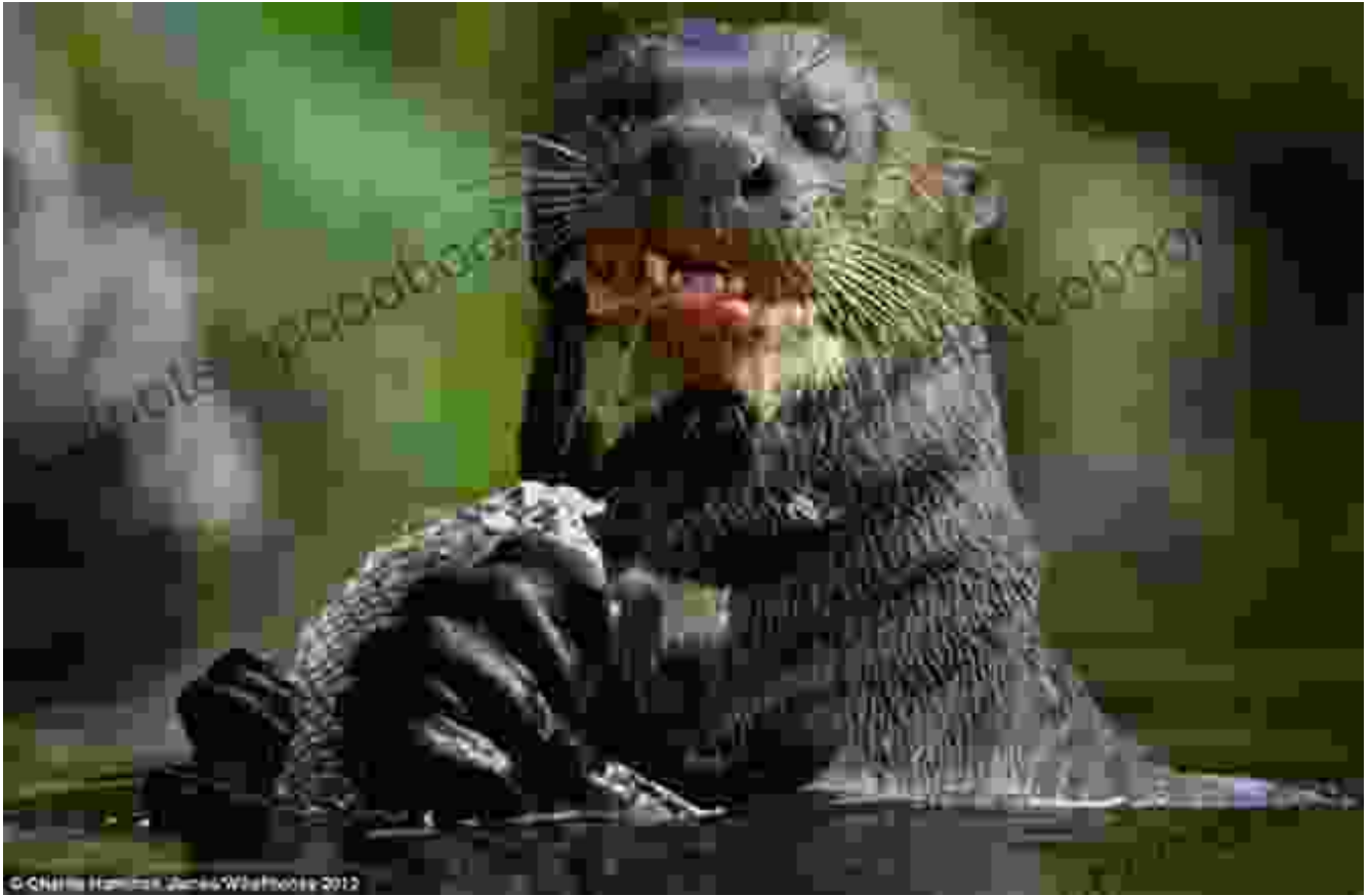
An otter eating a fish.