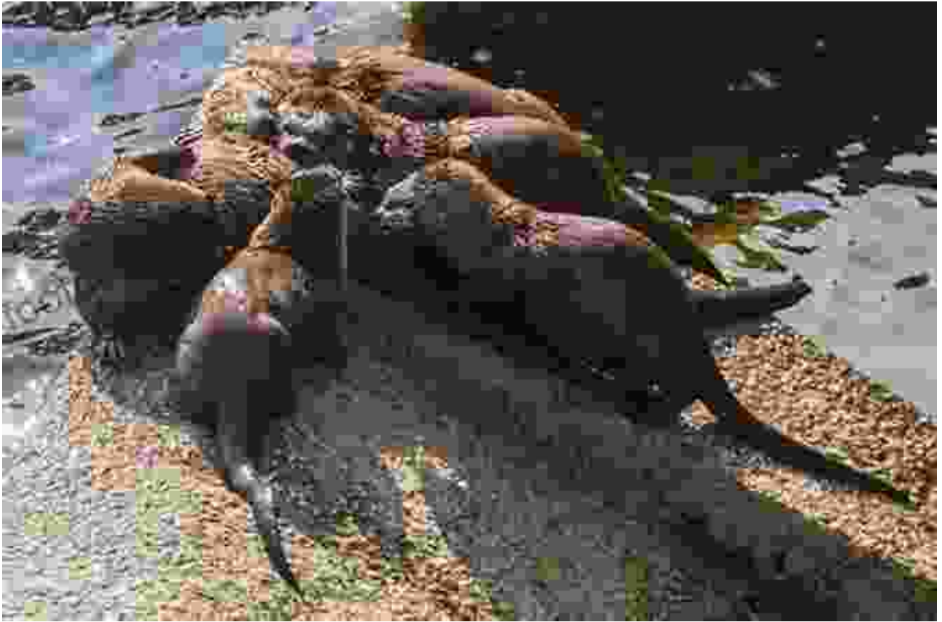
A group of otters playing on a rock.