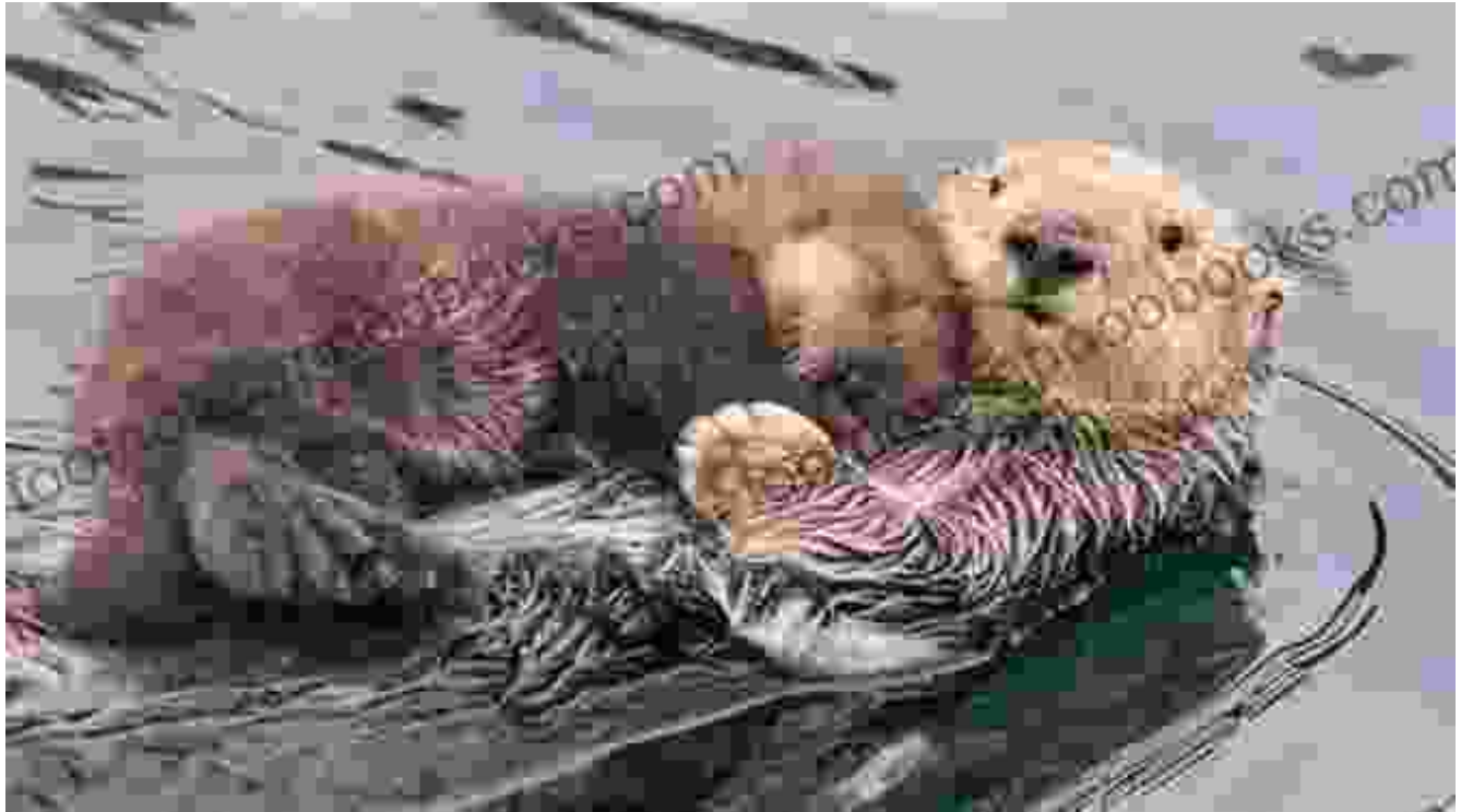
An otter sleeping in a den.