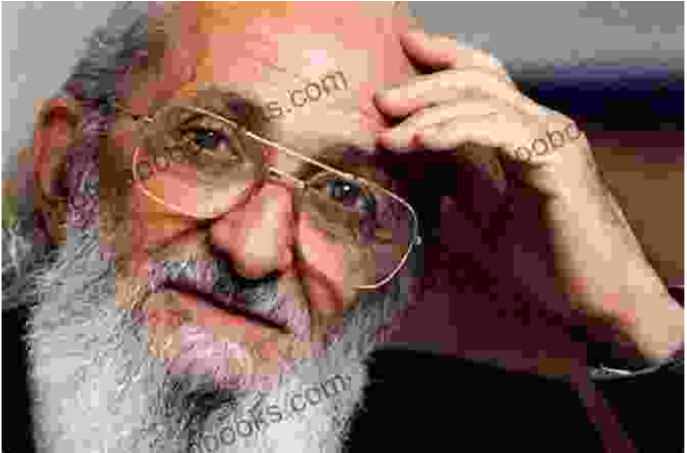
Paulo Freire, a transformative radical educator